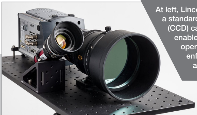
At left, Lincoln Laboratory customized a standard charge-coupled-device (CCD) camera with technology to enable long-duration, unattended operation; communication with law enforcement command centers; and real-time data processing.

more sensors with large-aperture lenses, narrow bandpass filters, and single-photon-sensitive imagers capture and form an image of this streak at a range of several miles. The sensors, spaced a distance apart, capture the streak from different angles, or geometric planes. The intersection of the planes yields a vector from which our algorithms can calculate the latitude, longitude, and terrain altitude of the laser’s originating location. Projected onto a topographically accurate map of the Earth’s surface, this information can be converted to the nearest street address if desired and transmitted via computer or smartphone to law enforcement.