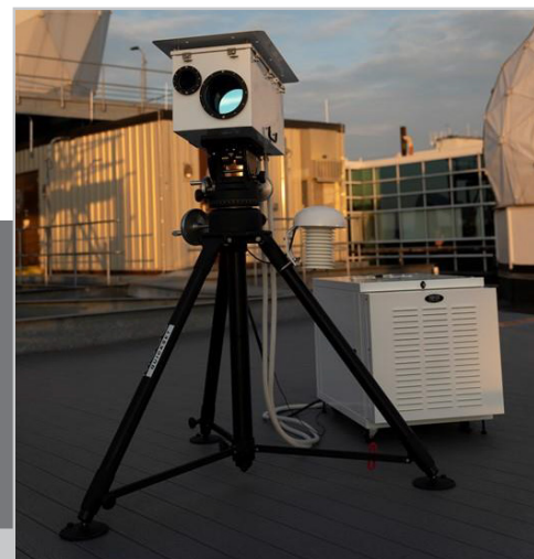
Above, a ruggedized sensor is mounted on a base so it can be set up unattended to monitor a region of airspace.